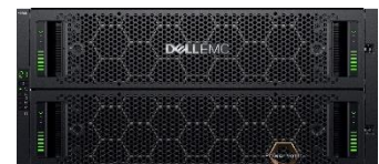
ME5084 84 drive / 5U

Optional ME5 expansion enclosures let you scale up to 336 drives or 8PB 1 . PowerVault ME412 and ME424 expansion enclosures can only be used with either ME5012 or ME5024 base arrays. The ME484 dense expansion enclosure is supported behind any of the ME5 base arrays. A variety of SSD, 10K and NLSAS drives (including FIPS-certified SEDs) are available.