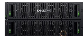
ME484 Expansion Enclosure 84 drive / 5U